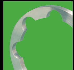
Waterjet Cut Plate