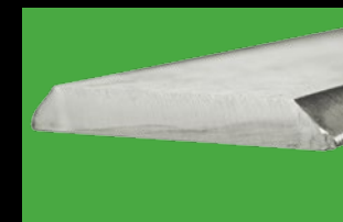
Plasma Beveled Plate