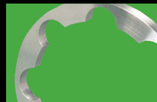
Waterjet Cut Ring