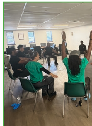
A Chair Yoga class in session.